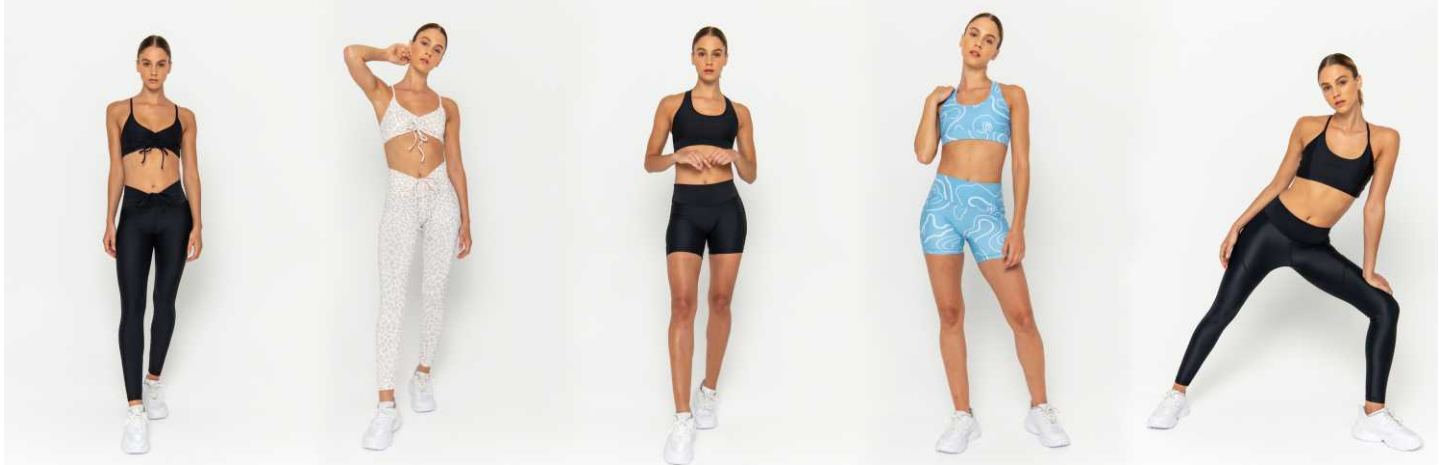
Dynamic Set - Plain