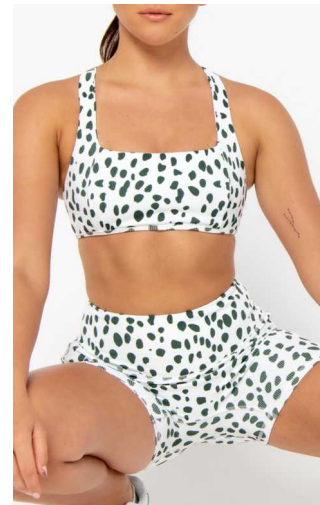
Tops & Shorts