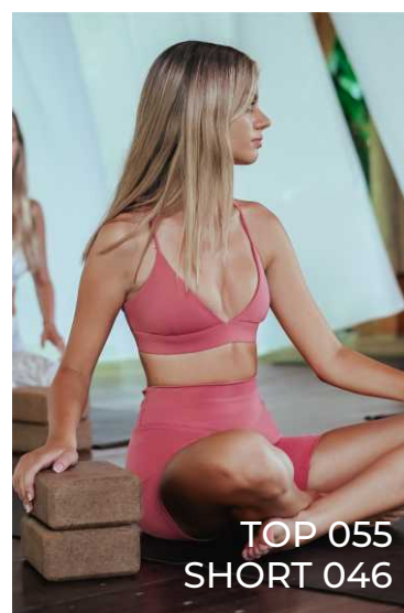
TOP 055 SHORT 046

To see a full mock-up branded in more detail, go here