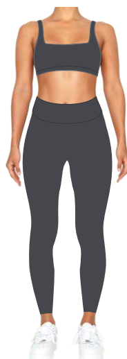
Top 057 Legging 056