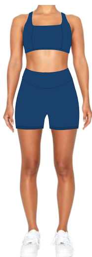
Top 045 Short 046