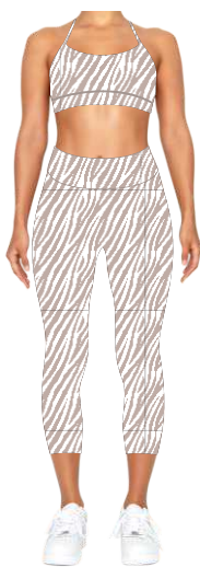
Top 053 Legging 054