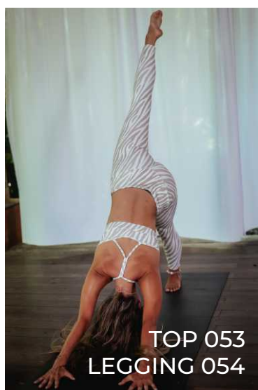
TOP 053 LEGGING 054